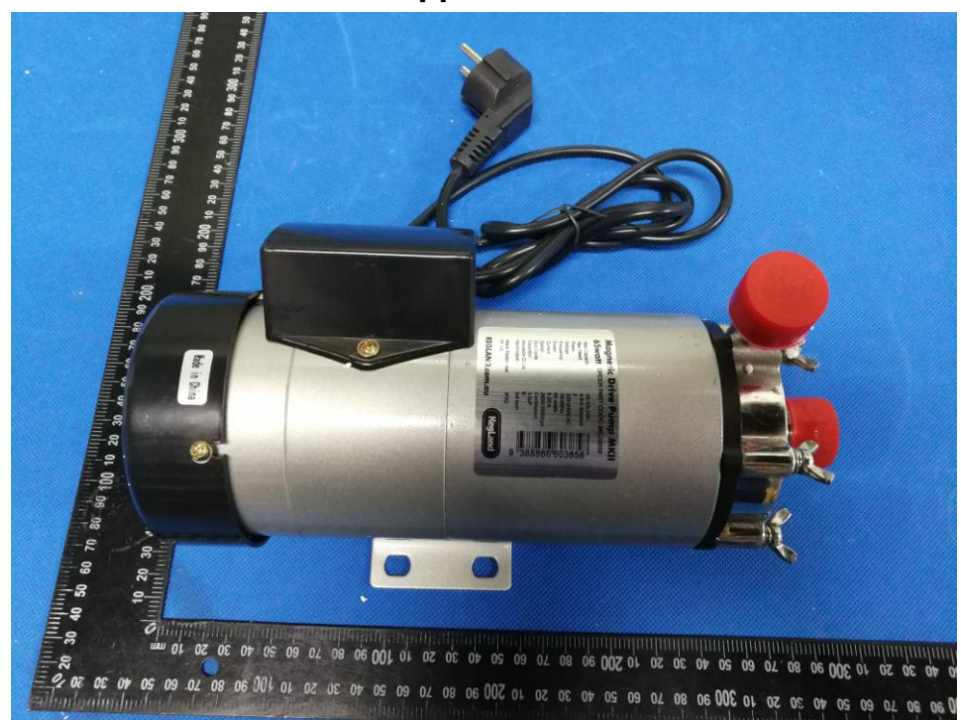
Photo 2 Appearance of EUT