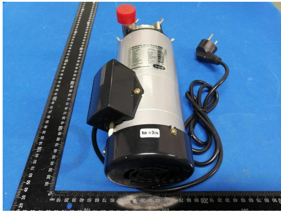
Photo 4 Appearance of EUT